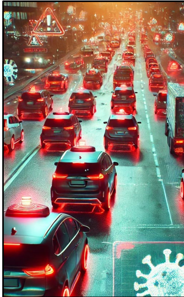
Generated with ChatGPT